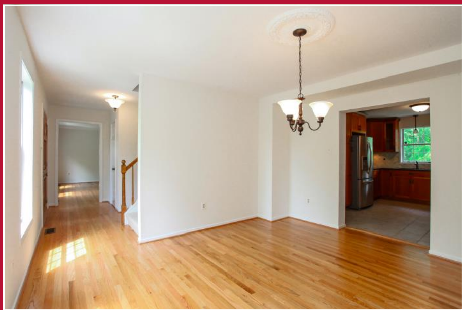
The sunny dining room features hardwood floors and offers quick access to the kitchen and living room.

Welcome to this Lyon Park modern colonial within a short stroll of Clarendon, shops, parks and schools. Located just 6-7 blocks from the Clarendon Metro, this fully updated 1987 home offers four spacious bedrooms upstairs, a gorgeous new kitchen and new bathrooms, all in the heart of Lyon Park. The beautiful country kitchen with cherry wood cabinets and granite countertops, opens to the breakfast nook and the large family room with fireplace. French doors take you to the outdoor deck and the tree lined backyard. The huge lower level recreation area has the makings of a great media room and includes a 5 th bedroom/office/studio with direct outside access. The home also boasts an attached 1-car garage and driveway, solar water heater, brand new HVAC system, refinished oak floors, and a wonderful master suite. Added feature: One year prepaid Home Maintenance Plan from Clarendon Home Services. Schools: Long Branch Elementary, Jefferson Middle School and Washington-Lee High School. A home this large is a rare find in Lyon Park! Come visit and stay for a lifetime.