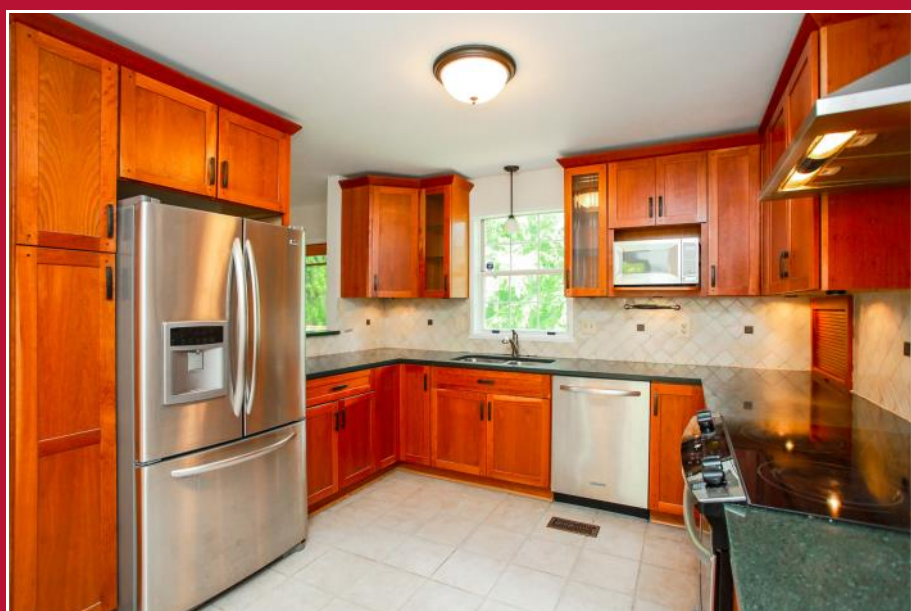
The country kitchen, updated in 2006, is large and bright, with cherry cabinets, stainless steel appliances and granite countertops. It offers easy access to the attached 1-car garage.