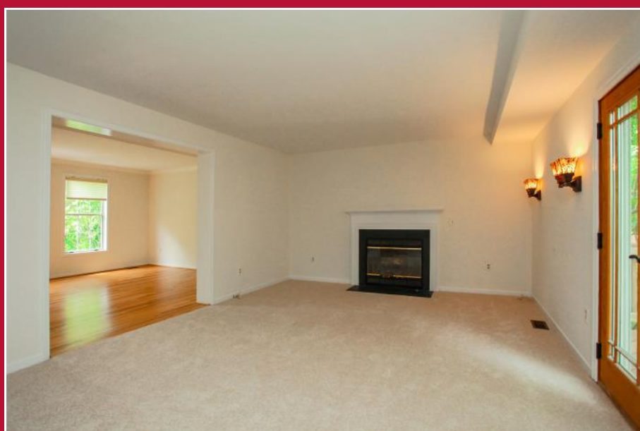
The spacious first floor family room has a wood burning fireplace and is perfect for unwinding and watching movies with the family.