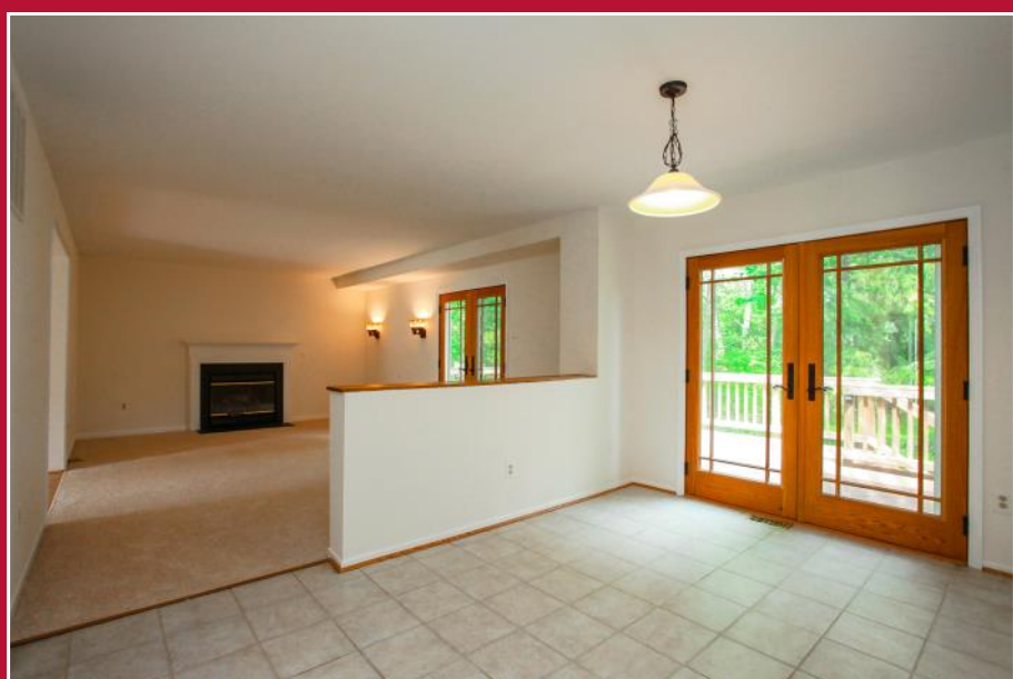
The breakfast nook is directly off the kitchen and features French doors that lead to a large outdoor deck and treescape.