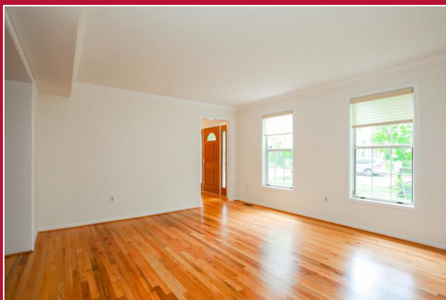
The main level features a lovely living room which offers plenty of space for everyone to socialize.