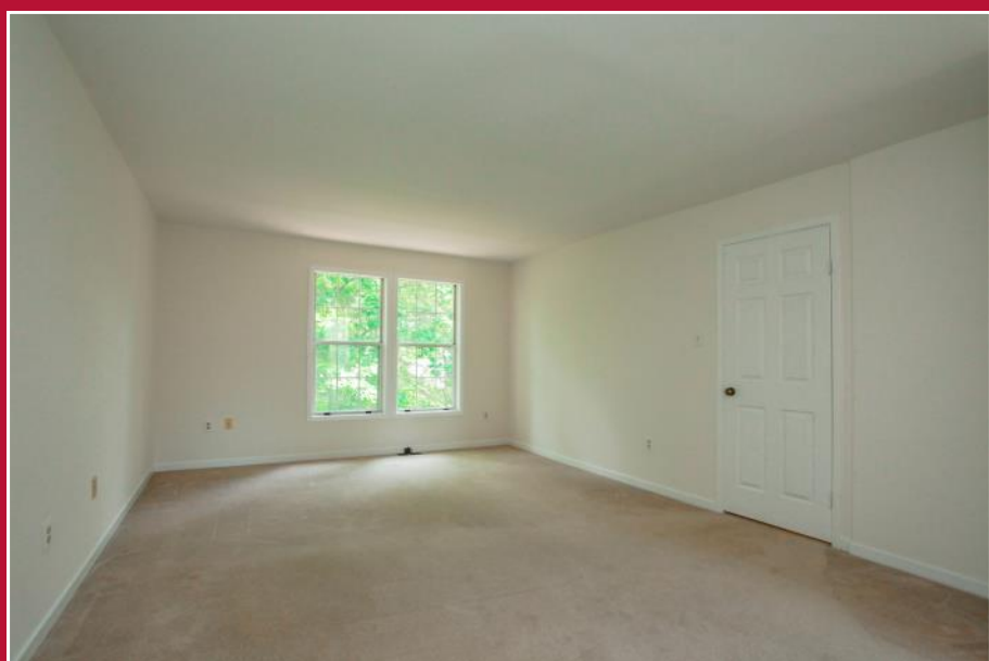
The master bedroom is fit for a king and queen with a walk-in closet and new bathroom 2009.