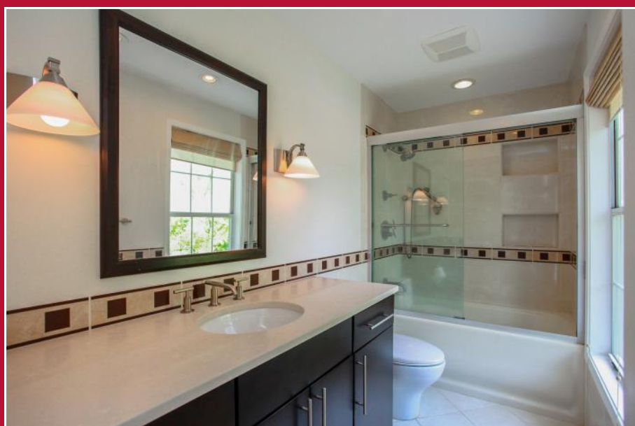
Master bath updated in 2009.