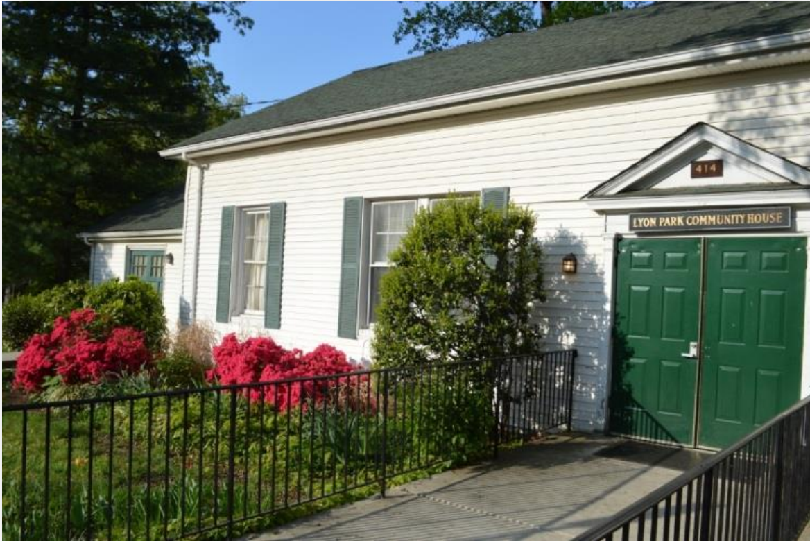
The 1925 Lyon Park Community House

Thanks for coming to the 2013 Villas & Vistas Tour!