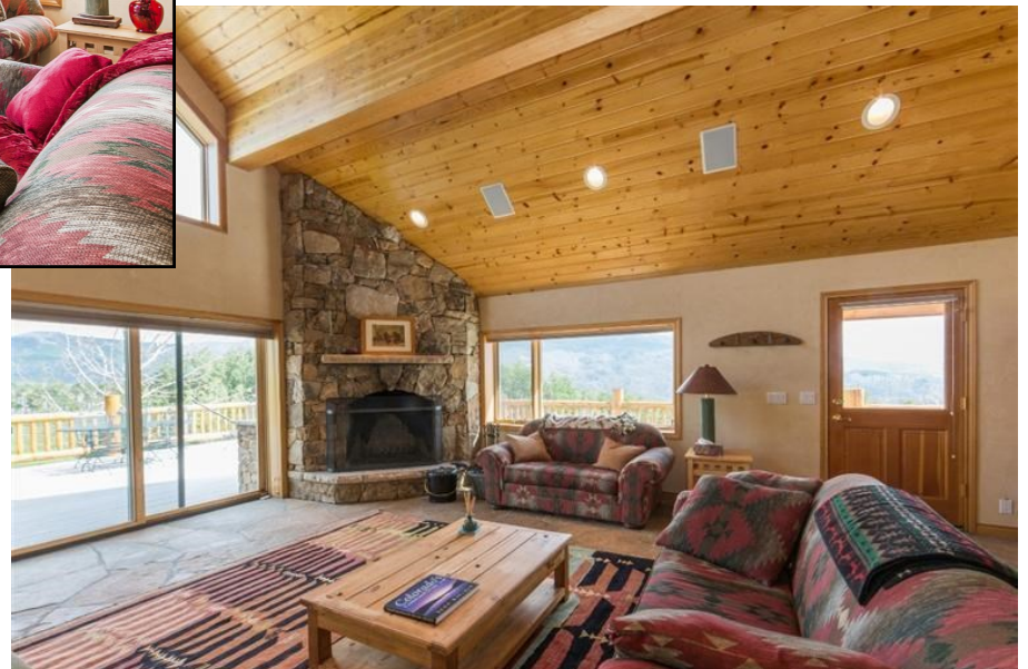
Great Room: Not Staged