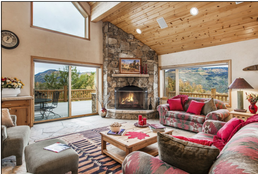
Great Room: Staged

Professional Staging Brings a Higher Sales Price