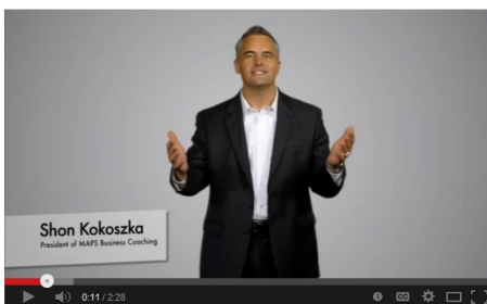
The ONE Thing Training: Teleseminars