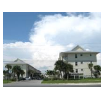
Gulf Island Condos 8436 Gulf Boulevard Year built 2006 *1+bunks/2, 2/2, 3/2