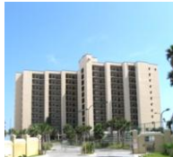
Navarre Towers 8271 Gulf Boulevard Year built 1984 *2/2, 3/2, 3/3