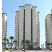
Summerwind Condos 8575 Gulf Boulevard Year built 2000 *2+bunkroom/2, 3/3