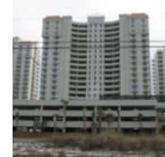
Beach Colony West 8501 Gulf Boulevard Year built 2009 *2/2, 3/3