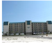
Emerald Surf 8245 Gulf Boulevard Year built 1981 *2/2