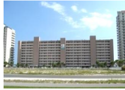
Navarre Beach Regency 8525 Gulf Boulevard Year built 1996 *2/2, 3/3, 4/4