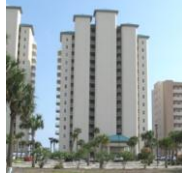
Summerwind West 8573 Gulf Boulevard Year built 2002 *2+bunkroom/2, 3/3