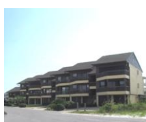
Sugar Dunes 1448 Tina Drive Year built 1982 *2/2