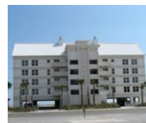
Viewpoint 8227 Gulf Boulevard Year built 1983 *4/4