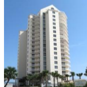
Belle Mer 8269 Gulf Boulevard Year built 1997 *2/2, 3/3, 4/4, 5/5.5