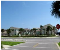
Beachview 8425 Gulf Boulevard Year built 1980 *2/2, 3/3