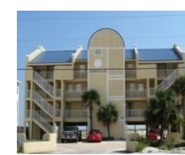
Sandollar 7885 Gulf Boulevard Year built 1985 *1/1, 2/2

***KEY*** 1/1, 2/2, 3/3 etc. indicates BEDROOM/bath configurations in the units in these buildings