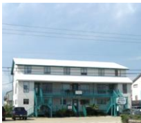
Summer Sands 8460 Gulf Boulevard Year built 1984 *2/1 (commercial)