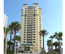
Caribbean Resort 8477 Gulf Boulevard Year built 1999 *3/2, 3/3