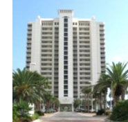
Pearl of Navarre Beach 8499 Gulf Boulevard Year built 1999 *2/2, 3/3, 4/4