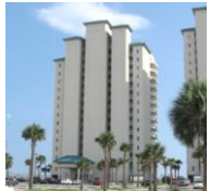
Inn at Summerwind 8577 Gulf Boulevard Year built 2000 *1+hallbunks/1.5, 3/3