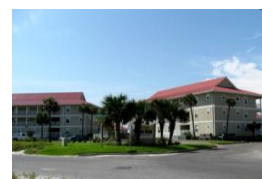
Sunset Harbour Villas Condos 7464-68-72-76 Sunset Harbor Dr. Year built 1998 *1/2, 1+hallbunks/2, 2/2, 3/2, 3/2.5

For information about units for sale in these buildings, please contact: