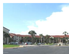
Sunset Harbor Condos 7453 Sunset Harbor Dr. Year built 1985 *1/1, 2/2