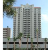
Beach Colony East 8515 Gulf Boulevard Year built 2002 *2/2, 3/3