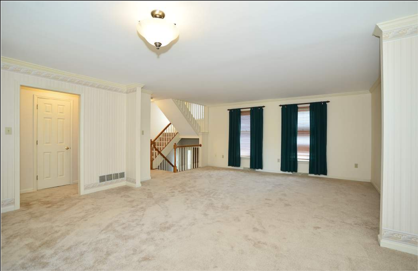
Several steps above the main entry you will find a wide open living & dining room with brand new carpeting that has been installed throughout all three levels! A first floor powder room is conveniently located off the main hallway leading into the kitchen area.