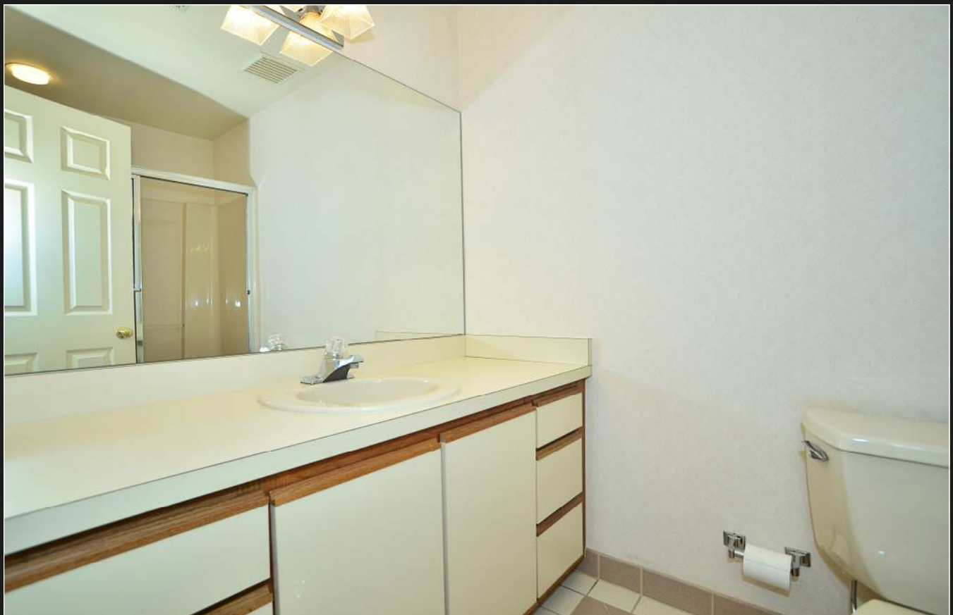
The master bath features a wide dual-sink vanity with brand new faucets & light fixtures along with ceramic tile floors & a tub / shower combination. A second full / guest bath can be found across the hall next to the other two bedrooms on the second floor.