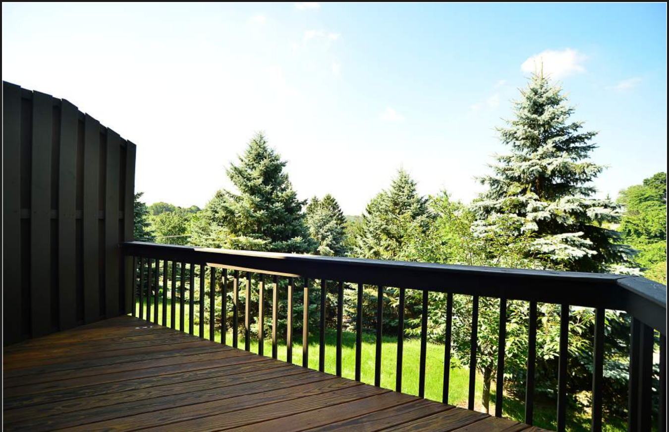
102 Christopher Circle is a deceptively spacious, 3 bedroom, 2 full / 2 half bath townhome in the Montour School District with a 2-car integral garage & a finished walk-out lower level game room.