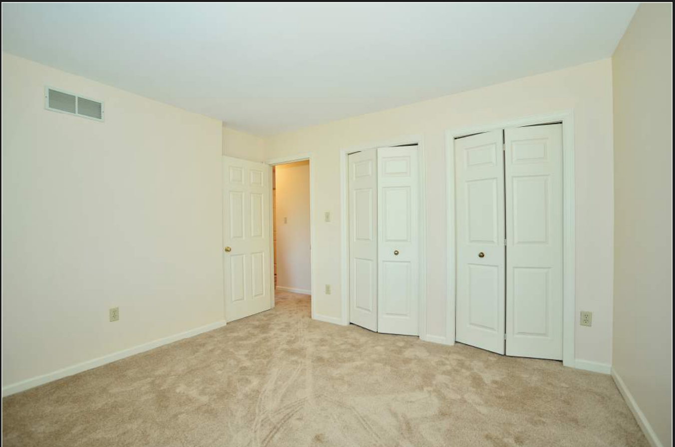
Bedroom #2 faces out back & features a large closet with two sets of doors. The third bedroom, pictured up above on the following page, is similar in size & finishes off the second floor plan.