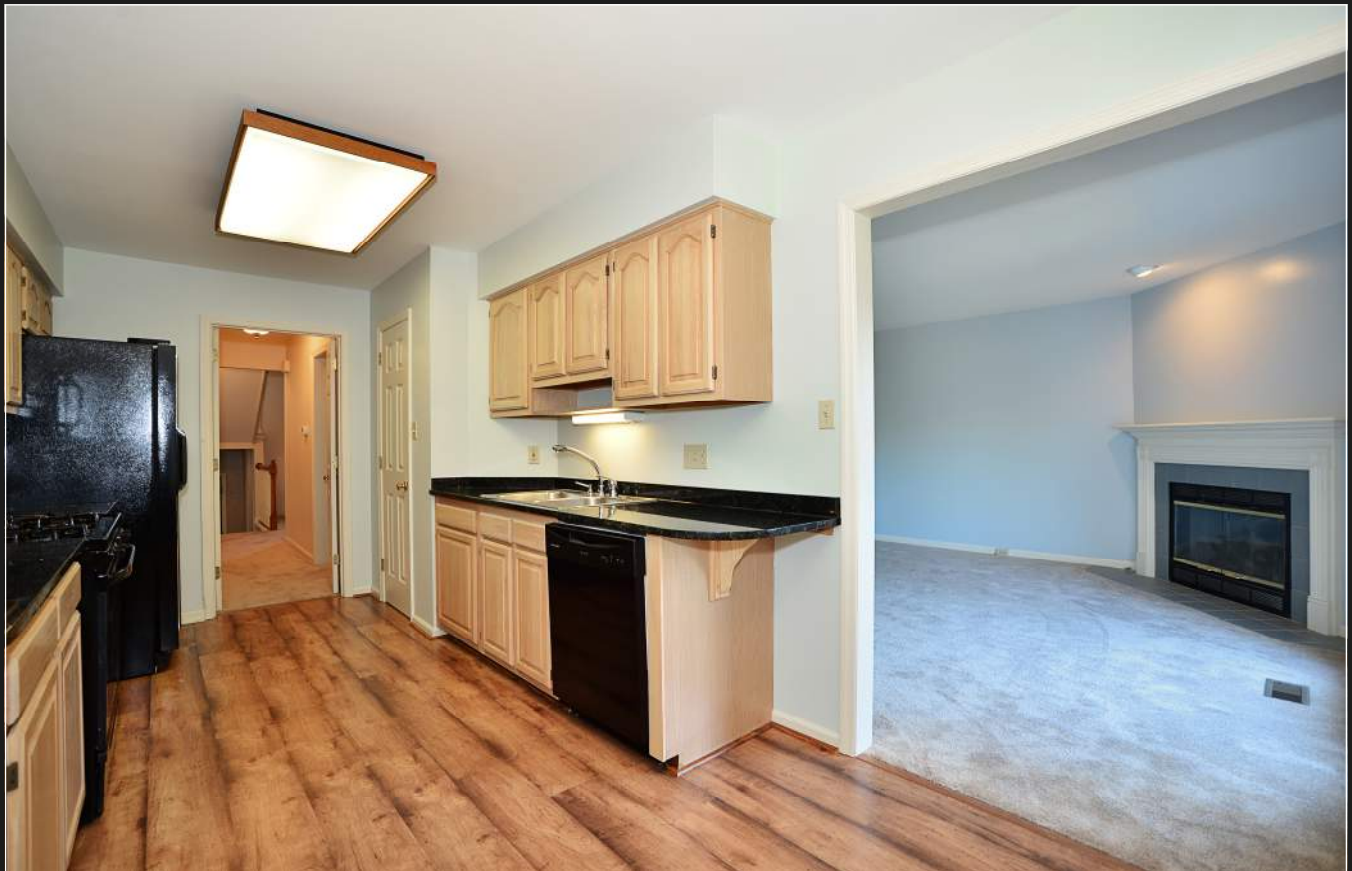
A large eat-in kitchen with a breakfast area completes this spacious main floor configuration and offers ample cabinet space, brand new granite counter tops, new laminate flooring & a generous sized walk-in pantry!