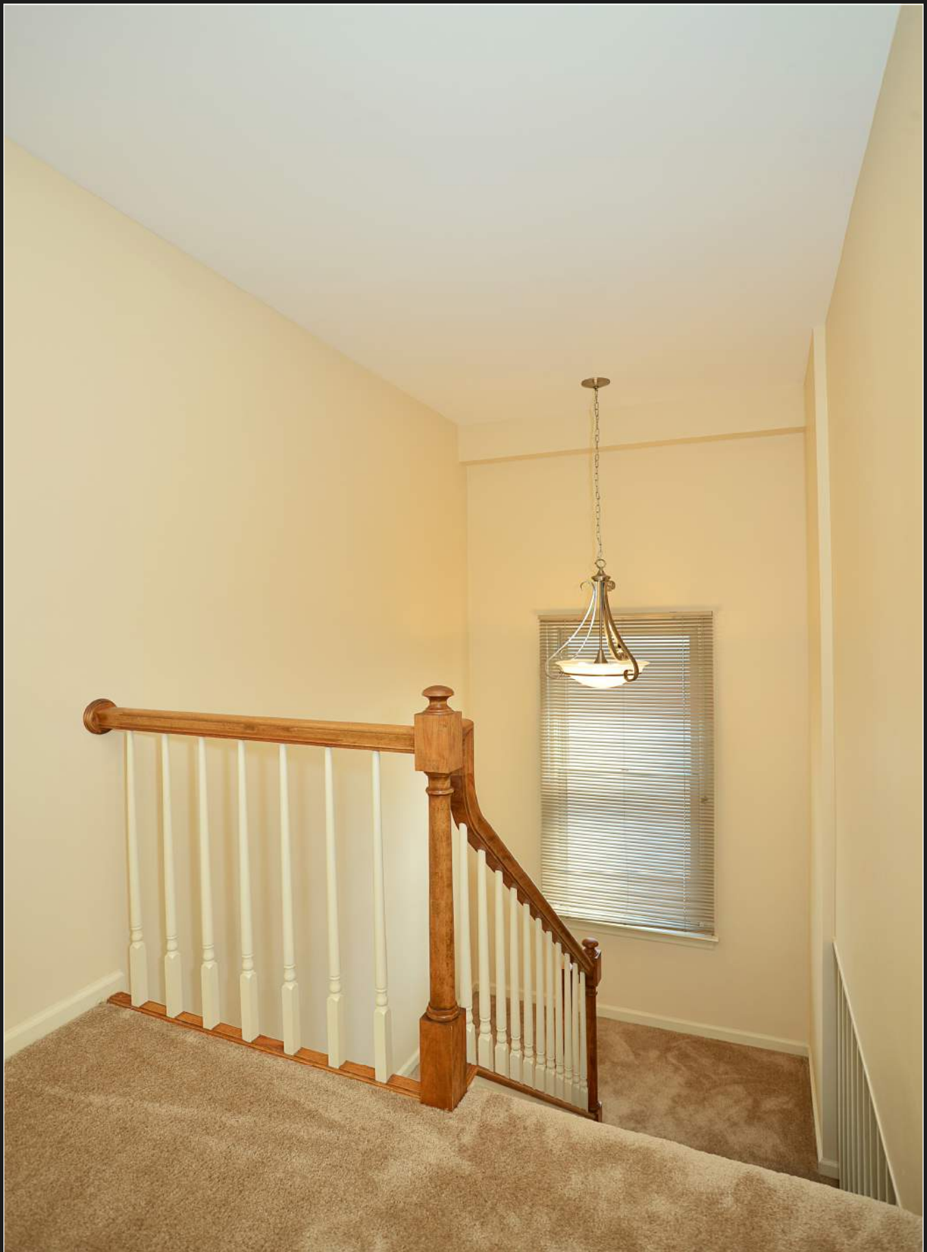
A graceful chandelier illuminates the staircase heading up to the second floor level & is accented by a stained oak railing with contrasting white round spindles.