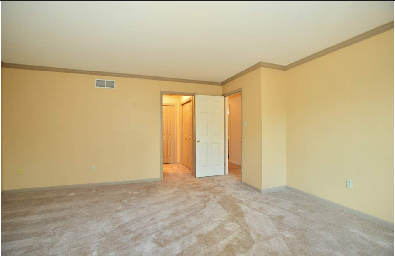
At 17' x 15' - this master suite is large enough for any king sized bed! A wrap-around corner closet is situated off to the side in between the bedroom & the master bath with separate his & her access doors.