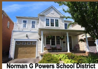
Norman G Powers School District

Oshawa $325,000 Tribute Home, Open Concept