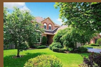
Whitby $479,900 Completely updated throughout!

Oshawa $325,000 Tribute Home, Open Concept