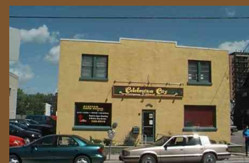
Oshawa $1,250,000 Major downtown property available