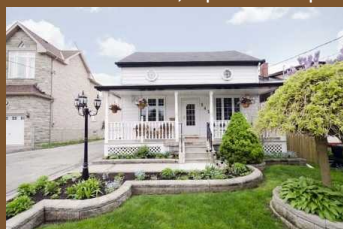
Toronto $649,900 4 Bedroom home on double lot