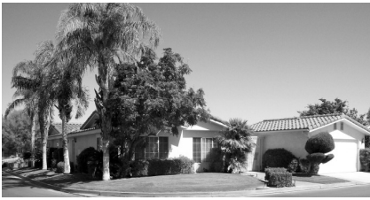
74882 Conestoga Jasmine, Corner lot, Stucco $158,000