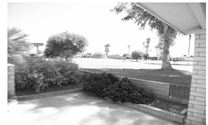
74765 Stage Line Drive Golf /Mt View, $200,000