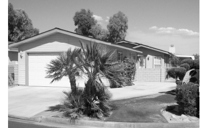
35340 Mexico Way Golf /Mt View, Furnished $175,000