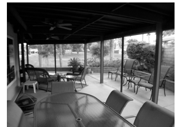
34945 Serenade Golf/Mt View, PERM FNDTN $290,000

Jeff & Paula www.jandpdesertproperties.com