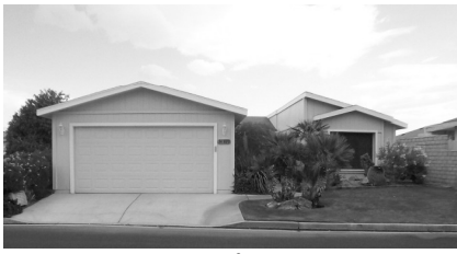
34870 Tioga Desert View, Split Floor Plan $119,000