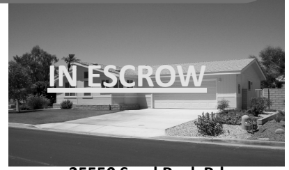
35550 Sand Rock Rd Newer Home on PERM FNDTN $130,000