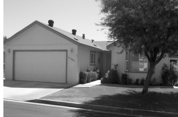
35482 Canteen Fireplace, large Enclosed Yard $165,800