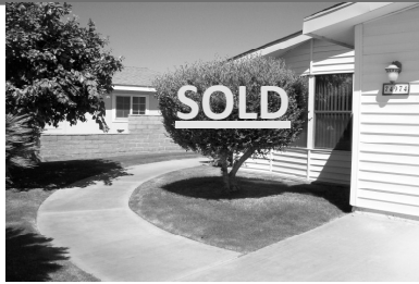
74974 Conestoga New carpet, paint, rolling shutters $127,000