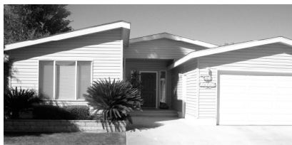
34867 Surrey Way Beautiful, split bedroom floor plan $211,000

Year round Ivey Ranch residents for all your Real Estate and Notary needs.