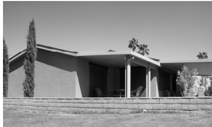
35033 Serenade Golf /Mt View, PERM FNDTN $197,000