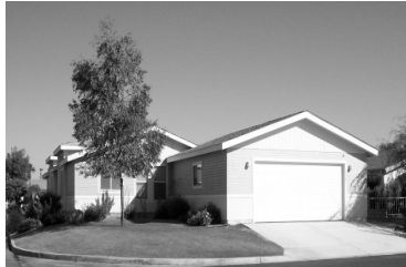
35601 Mexico Way Newer Home on PERM FNDTN $140,000