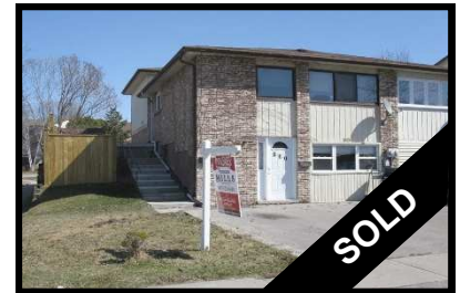
Sold in 4 Days Call me for these results!