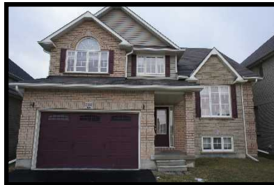
4 bedroom Ravine Lot with In Ground Pool. How are you spending your summer this year??