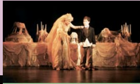
a performance in the making