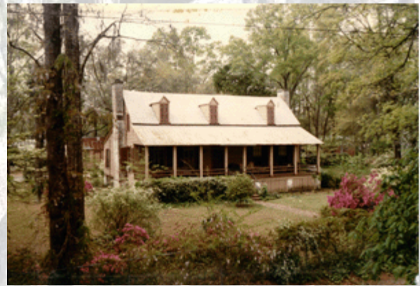
Heyward House, Hilton Head Island, SC

Hilton raved about the island’s beauty, encouraging settlement there. English settlers waited for the threat of both Spaniards and Native Americans to dispel before colonizing in 1670 to found South Carolina’s first permanent settlement where the Ashley and Cooper Rivers merge together, then called Charlestowne, and now called Charleston. Immigrants from Switzerland and lowland Scots from Northern Ireland settled the early townships. In the early 1700s, the current town of Beaufort was chartered, becoming the second English settlement in South Carolina.