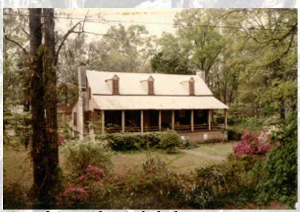
Heyward House, Hilton Head Island, SC