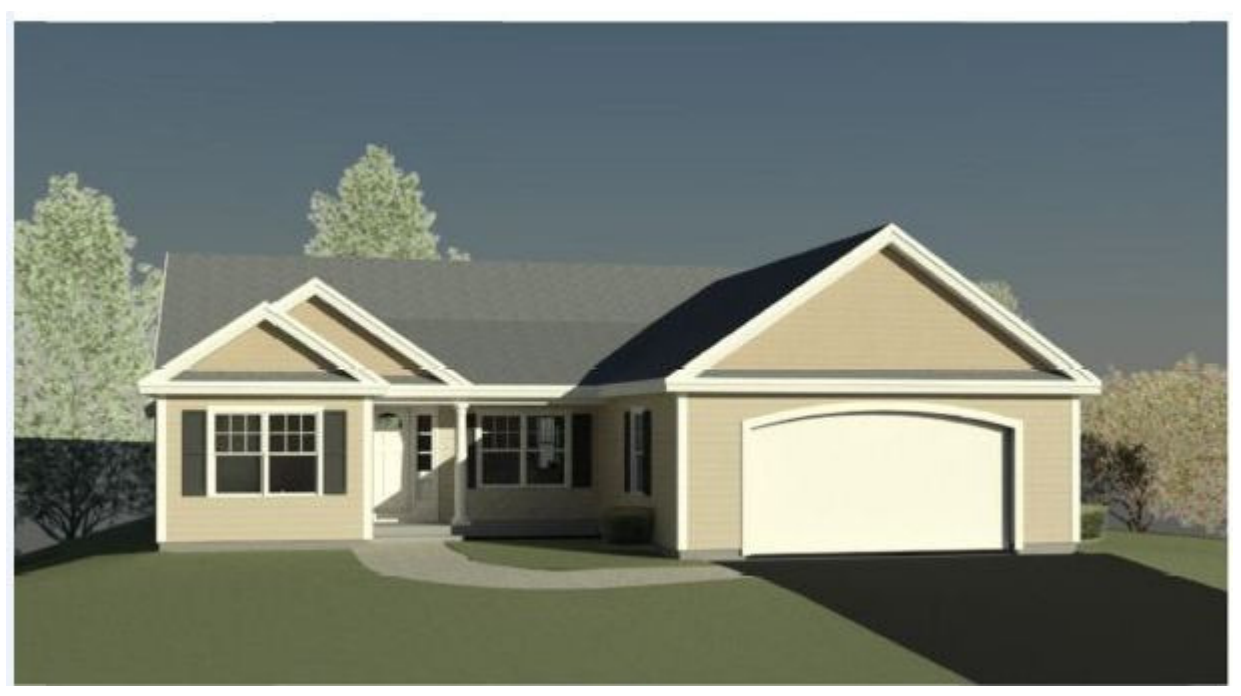
Total Living Space 1614 sq. ft.

Buildings Specifications for: Pilgrim Circle, Nashua NH