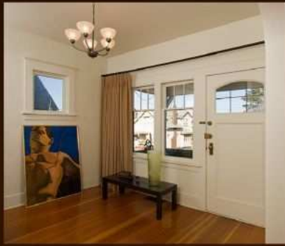
Formal Entrance Refinished Hardwoods.