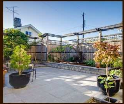
Private Patio Entertainer's Oasis.