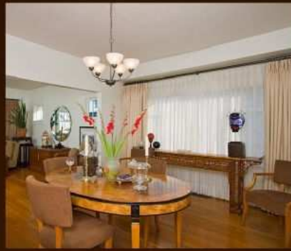
Spacious Dining Room Family and Friends are welcome.