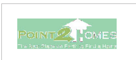
Point2Homes.com – Provided by Point2NLS as national marketing and advertising platform exclusively for real estate professionals