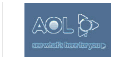
AOL Real Estate - Homepage of AOL.com which is a Web services company that runs one of the country's largest Internet access businesses