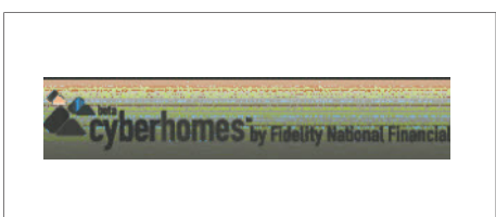
Cyberhomes –Website powered by Fidelity National Financial, Inc that provides home valuation and neighborhood information.