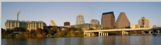
Austin, TX (Texas) - Vista of Austin's riverfront from Auditorium

Services provided includes national relocation assistance, buyer and seller representation for residential and investment properties.