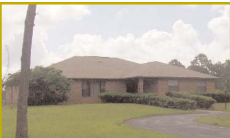
Malabar Custom-built 3BR/2BA/2-car garage brick home on 1.4 acres. Stone fireplace. Country living close to everything. $210,000.