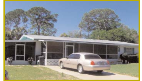
Rockledge 3BR/2BA block home. Potential 4th BR. 2 screened porches, fenced yard. On cul-de-sac. $60,935. UNDER CONTRACT!