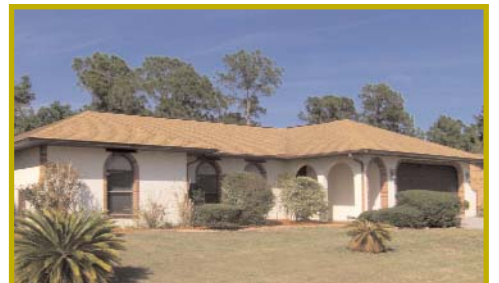
Palm Bay/Lockmar 1746 SF 3BR/2BA/2-car garage CBS home near Lockmar Elem. Privacy fence, screen porch, stone fireplace. $119,000.