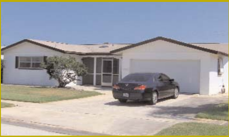
Merritt Island Well maintained 1532 SF 3BR/2BA/2-car garage home. New roof & A/C 2005. Large Fla. room, screened porch. $116,000.