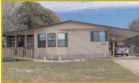
W. Melbourne /Best lot in Hollywood Estates! 2BR/2BA/2-car carport home with large encl. Fla. room, in active 55+ community. $49,000.