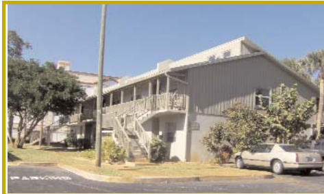
Historic Downtown Melbourne Condo 2BR/1.5BA 2nd floor end unit. Walk to restaurants, shops. $65,000. UNDER CONTRACT!