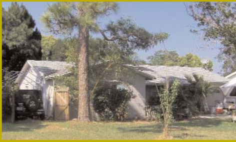
West Melbourne Private Oasis! 3BR/2BA/1-car garage home. Privacy fenced yard, pool, sauna, coi pond. Hardwood, tile, carpet. $70,000.