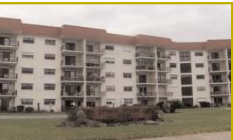
Rockledge Condo Rental. 4th Floor 2BR/2BA. Great river view from balcony. Community pool, dock, exercise rm. Available 7/1. $800/mo.