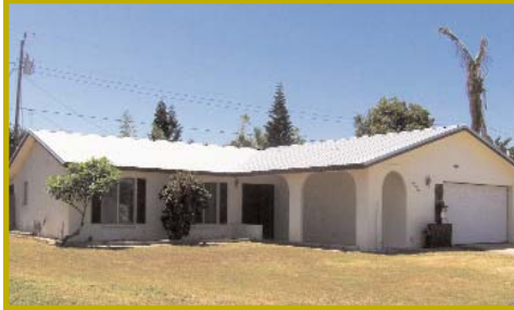
Beachside Walk to the beach from this 2BR/2BA/2-car garage CBS home. Privacy fenced yard. $125,000. UNDER CONTRACT!