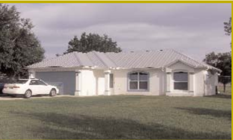
SE Palm Bay 1440 SF 3BR/2BA/2-car garage split plan CBS home on .76 acres. Lifetime metal roof. $94,000. UNDER CONTRACT!