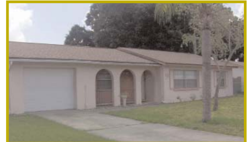
W. Melbourne Rental 3BR/2BA/1-car garage CBS home, available 6/1. W/D. Convenient to everything. Large back yard. $875/mo.