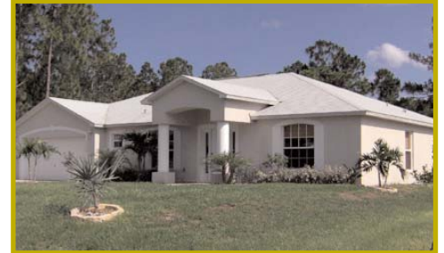
NW Palm Bay Rental 2020 SF 3BR/2BA/2-car garage home w/fenced back yard. City water. Available 7/16. Pets considered. $1,000/mo.