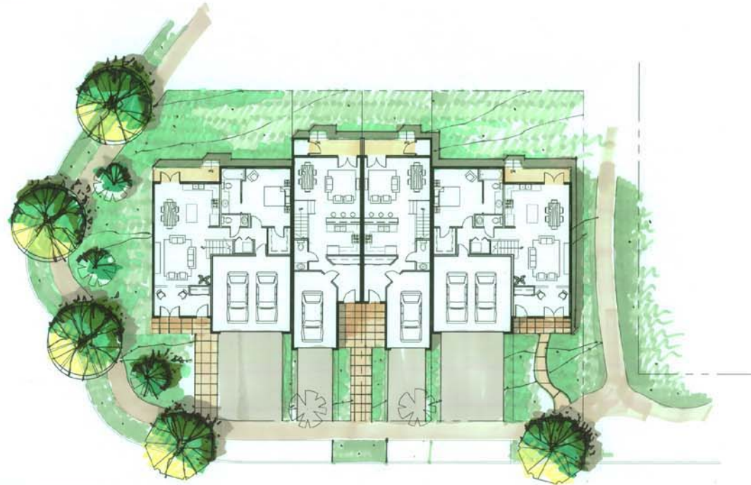
1 FIRST FLOOR PLAN A1.1 SCALE: 1/8" = 1'-0"