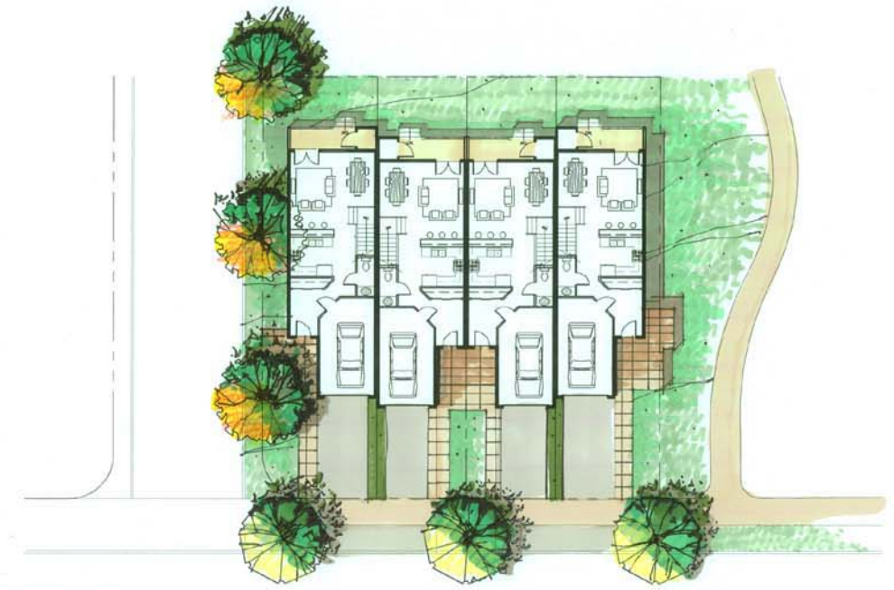
1 FIRST FLOOR PLAN A1.2 SCALE: 1/8" = 1'-0"