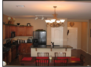
20732 N Marina Ave Maricopa