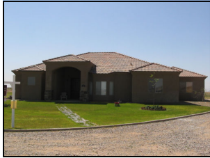
420 S David Cr Casa Grande