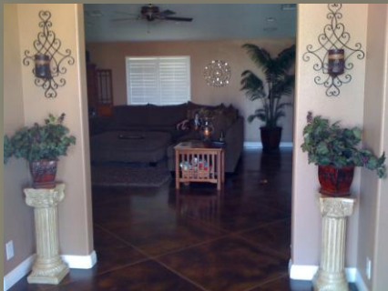
Entry looking into Family Room