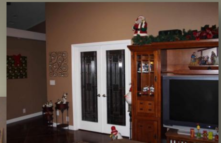
Custom Cut Glass Door Entry into Bonus Room From Family Room