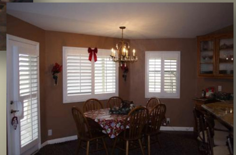
Breakfast Dining Room