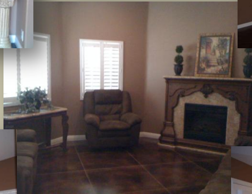
Formal Living Room