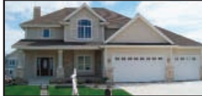
1212 O'NEIL PASSAGE : Waunakee Beautiful 4br, 2.5ba, 2669 sq ft w/ fireplace, 3-season porch, mstr suite, exp LL & more! Ext. 286