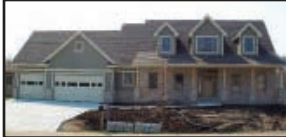
819 WOODS GLEN CT De Forest, 4br, 3.5ba, 4300+ sq ft, ML master bdrm, walk-out LL, overlooks conservancy - A must see! Ext. 366

Virtual Tours available for all completed homes at www.deverycash.com