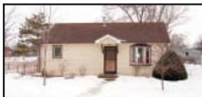
1907 W 7th AVE : Brodhead. Great starter home w/ 2 bdrms, 1bath, 768 sq ft, 2-car garage, on corner lot. Ext. 246