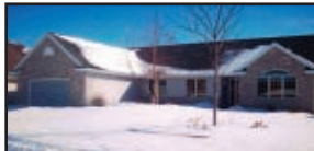
3637 ICE AGE DR , Elegant 4br, 3ba w/ 3600+ sq ft, cathedral & tray ceilings, finished, exp LL w/ bdrm, bath, office & craft room! Ext. 386