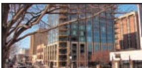
100 WISCONSIN AVE 9th floor condo, southern exposure, gourmet kit. & high end finishes, 2 br. + den, 2 ba. 2000+ sq ft. Ext. 226