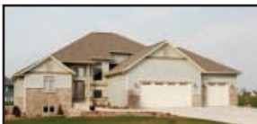
3050 SADDLE BROOK TRL , 3br, 2.5ba on 3/4 acre lot. Mstr Bdrm on ML w/ lrg walk-in shwr, double vanity & jacuzzi tub. Ext. 546