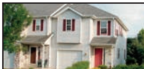
6147 DELL DRIVE #4 , END UNIT! 3 BR, 2.5 BA, 1375 sq. ft. townhouse, expos. LL. All new appliances. Ext. 266