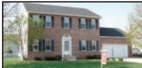
3734 WOODSTONE DR MDSN , w/ 4br, 2.5ba you will love this colonial located in Country Grove Estates. 2200+ sq ft. Ext. 426