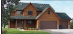
NORTHERN BAY , Overlooking 18th hole & clubhouse. Spectacular home in Adams Co. Great rental history. 5 BRs, 3.5 BAs, furnished. Ext. 606