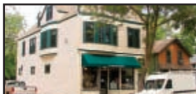
1356 WILLIAMSON ST . Loft style condo! 1BR/1BA, 990+sqft. Maple flrs, stainless steel appl. Ext. 427 www.WillyStreetCondos.com