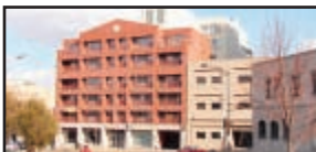
UNION TRANSFER : Downtown Upscale 3br, 2 ba, 2031 sqft condo facing Lake Monona w/ granite baths, SS. appl. private Indry & balcony! Ext. 726