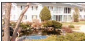
83 Golf Pkwy : 2br, 2ba, 1310 sqft condo w/ fireplace, prvt laundry, 3-season porch & access to pool, golf, tennis & fitness center! Ext. 766