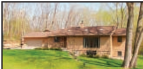
TOWN OF SPRINGFIELD , Private 4br, 3.5ba ranch w/ 3400+ sqft on 1.4 acre wooded lot! 2 way fireplace, fin. walkout LL, 4+ garage! Ext. 776