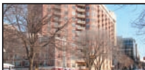
METROPOLITAN PLACE , 2bdrm, 2ba like new condo on 3rd flr w/ private laundry, fireplace & balcony! Large pets OK. Ext. 746